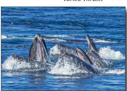
Humpback whales at Point Lobos